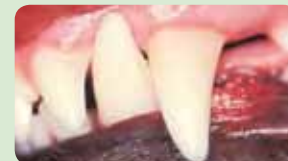
(1) Healthy mouth